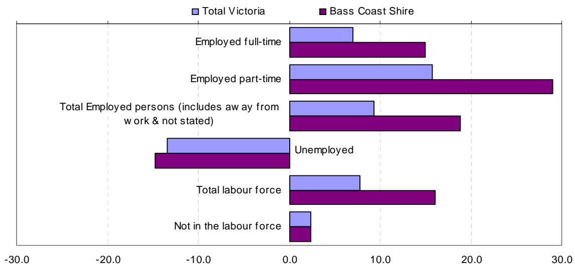
% Change in Labour Force: Bass Coast Shire & Victoria 2001 to 2006